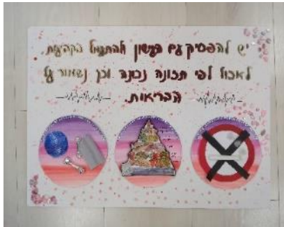
Third place: Three components of lowering your blood pressure – Quitting to smoke, a balanced diet and physical activity – by S.R.