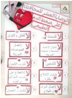
First Place: The Ten Commandments – by Grade 6B